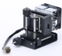
Thermostatic Cell Holder