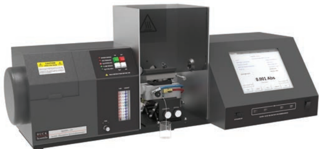
235ATS AA Spectrophotometer

High energy optical design for superior sensitivity In-line D2 Background correction Automated wavelength setting Push button oxidant change-over for N2O Flame detector with automatic gas shut down Sample drain sensor to prevent flashbacks Automated Slit selection Push button ignition 10" Color touchscreen Made and supported in the USA Educational Model Available Buck AA's Thrive where others fail.