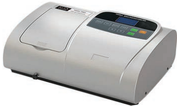
1041 Visible Spectrophotometer