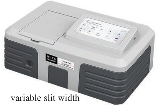
7041 Double Beam UV/Vis Spectrophotometer

variable slit width (0.5/1.0/2.0/4.0nm) 10" color touchscreen 190-1100nm range