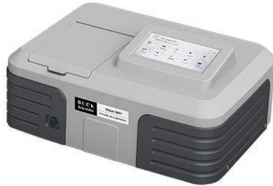
3041 Single Beam UV/Vis spectrophotometer

2nm bandwidth for high resolution 190 - 1100 wavelength range 7 inch color touchscreen